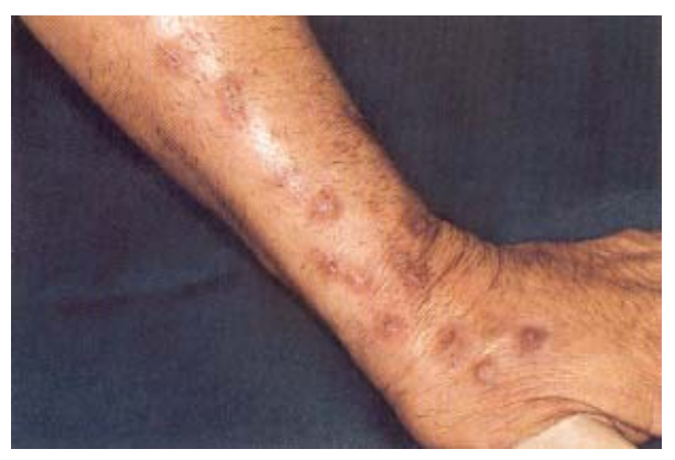
Fig. 3. Lichenified nodules resulting from chronic scratching to root out "parasites".

recurrence of delusions.<sup>19</sup> However, many patients may need long-term pimozide. The effective dosage is maintained for at least 1 month. Thereafter it can be tapered off gradually. Should there be an exacerbation of symptoms, the patient may be restarted on pimozide and treated in the similar time-limited fashion. The advantage of treatment with a time-limited fashion in contrast to continuous long-term medication is that the risk of tardive dyskinesia may theoretically be reduced.