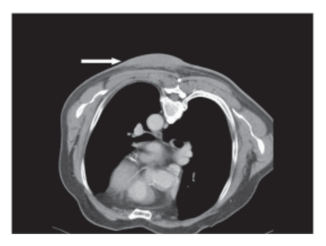
Fig. 2. Soft tissue mass in the subcutaneous tissue plane and stranding of adjacent adipose tissue.

He had a relapse in February 2004, with para-aortic nodal disease and pulmonary metastases evident on computed tomography. He developed an inflammatory subcutaneous mass at the right scapula region in September 2004. This lesion grew in size and caused increasing pain. Computed tomography showed a subcutaneous mass not dissimilar from that of WT. He underwent wide excision of this lesion to palliate his symptoms in January 2005. Histology revealed metastatic mucinous adenocarcinoma involving the dermis and subcutis. TW succumbed to metastatic disease in April 2005