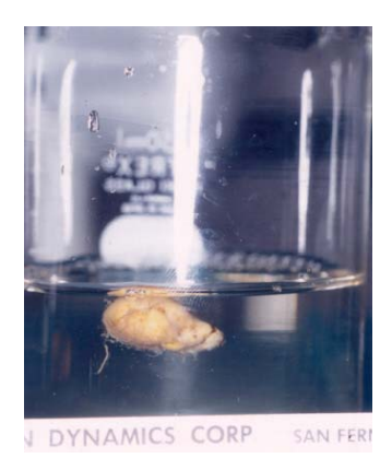
Fig. 2. Hypodensity of lipoma leads to buoyancy in water.

At this point, it may also be prudent to draw attention to a possible phenomenon of an infiltrating lipoma. Unlike the normal lipomas, infiltrating lipomas are not encapsulated and invade readily into the deep soft tissue.<sup>9</sup> This accounts for 62.5% of its recurrence after surgical excision.<sup>10</sup>