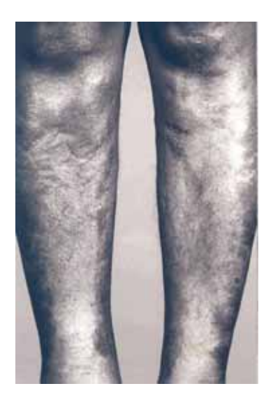
Fig. 1. Indurated plaques on both legs of a 45-yearold patient with nephrogenic fibrosing dermopathy.