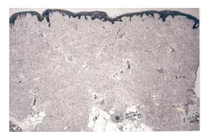
Fig. 2. Dermal proliferation of spindle cells with septal extension into the subcutis. (Haematoxylin and eosin stain, original magnification x40)