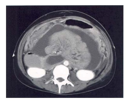
Fig. 3. CT scan of the abdomen (12 April 2001) showing extensive peritoneal carcinomatosis with intestinal obstruction due to serosal metastases and gross ascites.

and an emergency laparotomy was performed for suspected acute appendicitis.