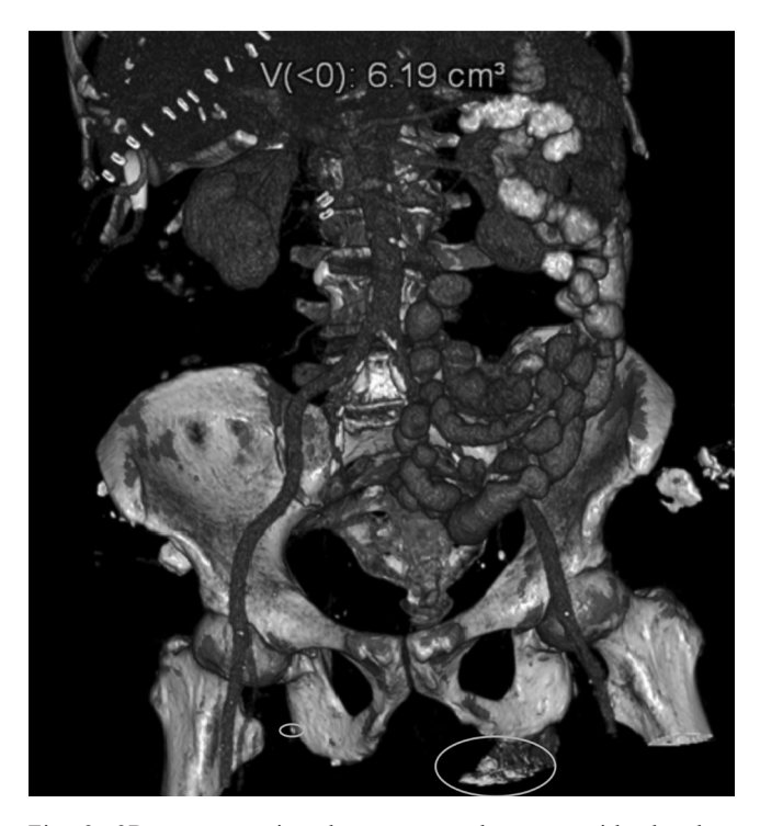
Fig. 3. 3D reconstruction demonstrates the mass with abundant monosodium urate deposition at the region of the left ischial tuberosity. Right upper abdominal surgical clips are seen due to recent cholecystectomy. Some green artifacts (2 circled areas) are seen over the liver, which can occur due to noise, beam hardening or calcifications.

diagnosis is with joint fluid aspiration for monosodium urate crystal analysis via polarisation microscopy. However, joint aspiration is invasive with a risk of complications and may be unreliable when there is only a minimal joint effusion. Furthermore, it is estimated that only 3% of primary care gout patients actually undergo joint aspiration.<sup>2</sup> The advent of DECT thus offers the clinician a non-invasive and accurate method of assessing for gout.