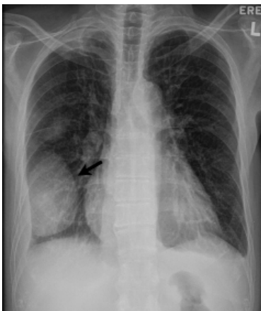
Fig. 1. Posterior-anterior chest radiograph.

This is consistent with the diagnosis of left ventricular failure. A repeat chest X-ray 4 days later showed that the right lung opacity and pleural effusions had vanished (Fig. 4).