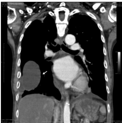
Fig. 2. Coronal reconstructed image of the CT thorax.