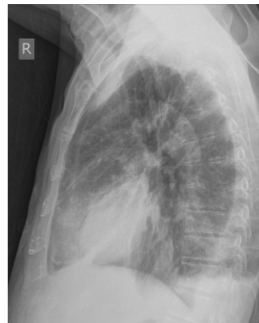
Fig. 3. Right lateral chest radiograph.