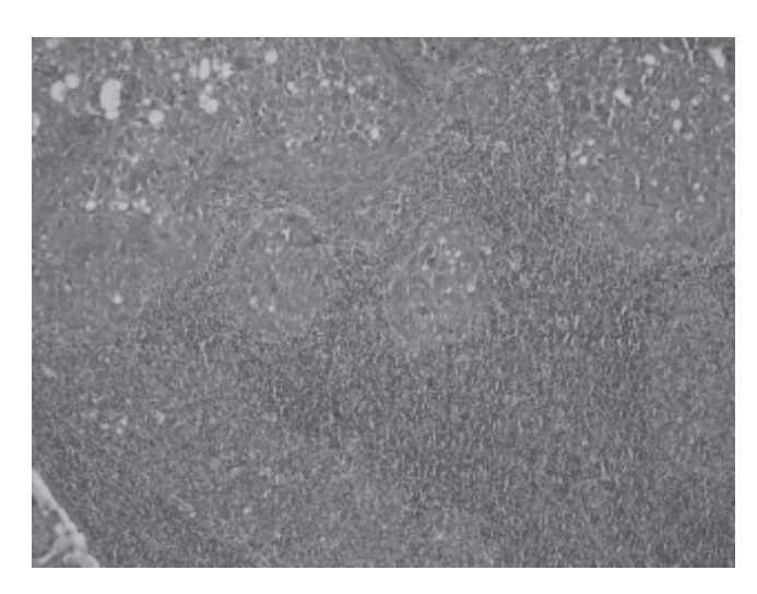
Fig. 1. Inguinal lymph node excision biopsy. Sections of the lymph node showing multiple sheets and nests of metastatic serous carcinoma infiltrating lymph node parenchyma (Haematoxylin and Eosin stain x20).

An exploratory laparotomy was performed on 19 August 2005. Intraoperative findings were that of a 10-cm left ovarian mass with an intact capsule. There was no ascites. The liver, diaphragmatic and subdiaphragmatic surfaces, stomach, small and large bowels, omentum and peritoneal surfaces were all normal by inspection and palpation. There were no palpable pelvic or para-aortic lymph nodes. Frozen section of the left ovary showed adenocarcinoma, similar to the findings from the earlier right inguinal lymph node excision biopsy. Total hysterectomy, bilateral salpingo-oophorectomy (THBSO) and partial omentectomy were performed. Histopathological examination revealed a moderately differentiated papillary serous adenocarcinoma of the left ovary, with the presence of intra-ovarian vascular