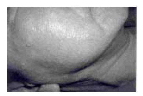
Fig. 1. Sebaceous hyperplasia on the right face.