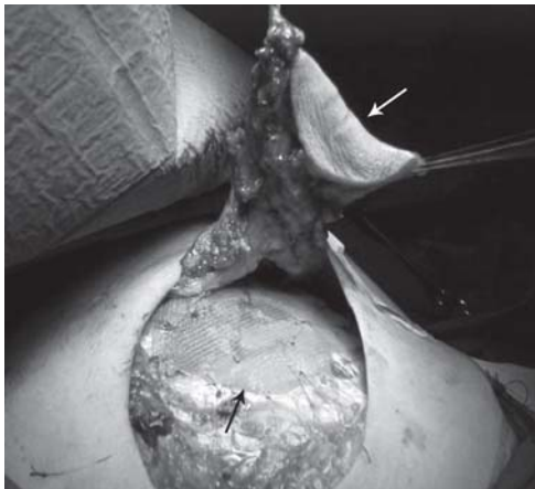
Fig. 2. Reconstruction of the residual chest wall defect with polypropylene mesh sheet under tension (black arrow) and myocutaneous latissimus dorsi flap rotation (white arrow).

the patient to have a better quality of life (QoL). She died 2 years after the surgery.