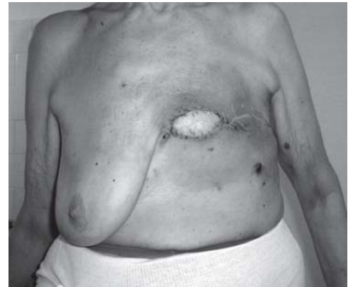
Fig. 3. Postoperative anterior view of the patient demonstrating stability, water and airtight closure, and acceptable appearance of the chest wall.

Treatment of pulmonary hernias depends largely on whether they present as symptomatic or asymptomatic. Some authors advocate routine surgical treatment for all hernias, 6 but generally, only symptomatic hernias are treated surgically, while asymptomatic ones are treated